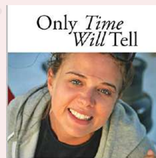
E-Book, Only Time Will Tell - Len Nokes £7.95