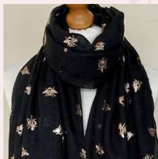
Our Orchard bee scarf £10