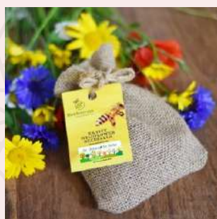
Bee seed bombs for the garden £8