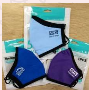
Health Charity Diolch NHS face masks £5