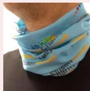
Health Charity buff £5