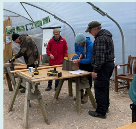
Making bird houses.

Work in the woodland has seen the removal of some damaged Ash trees which have then been processed and brought onto site by our groups. Patients, staff and our volunteers have been busy chopping this wood for our fire pits and winter warmth with the remainder milled off site for later usage on the meadow.