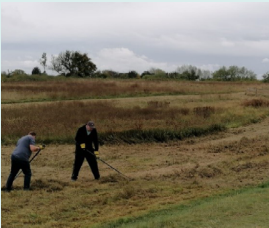
Volunteer group raking the meadow after being cut.