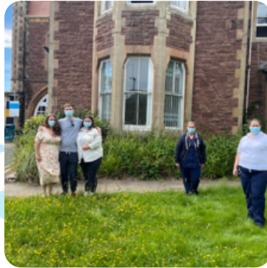
520 mile walk in aid of the Prop Appeal