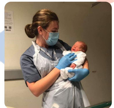
Third sector grant scheme now open