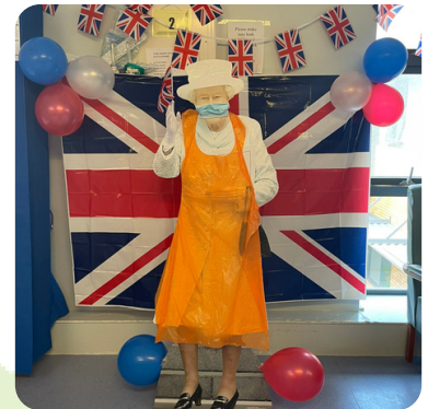
Health Charity partners with Stock Shop UHW